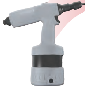
Pull to Stroke