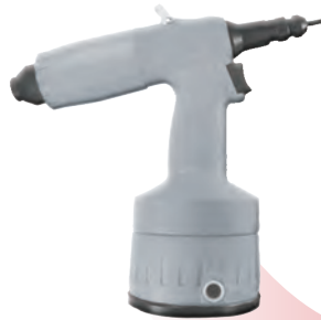
Pull to Pressure